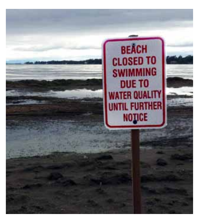
SAAWA wants to see St. Albans Bay Town Park restored for full summer use and enjoyment by area residents and visitors.