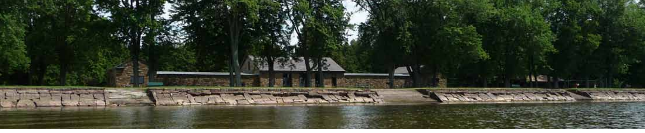
The deserted Town Park on St. Albans Bay. A beautiful spot which used to receive 65,000 visitors per year, it is now unusable to the public in the hot summer months when weed growth reaches critical levels, washes onto shore and begins to deteriorate in the water. The resulting blue green algae, thick mats of weeds, turbid water and the nauseating odor makes swimming impossible, and lake water dangerous for people and animals.