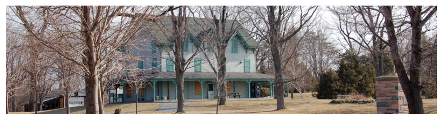
Kill Kare State Park Destination of June 6, 2009 Walk-a-Thon